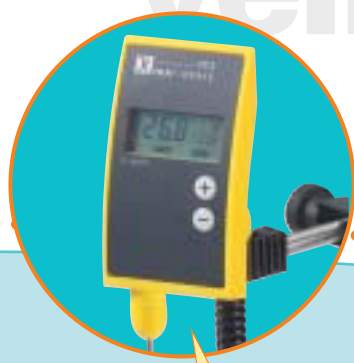
TC 2 Id-Nr. 3349000

The holding rod is used to support the temperature controller TC 2 to the boss head clamp H 44 and the support rod H 16 V .